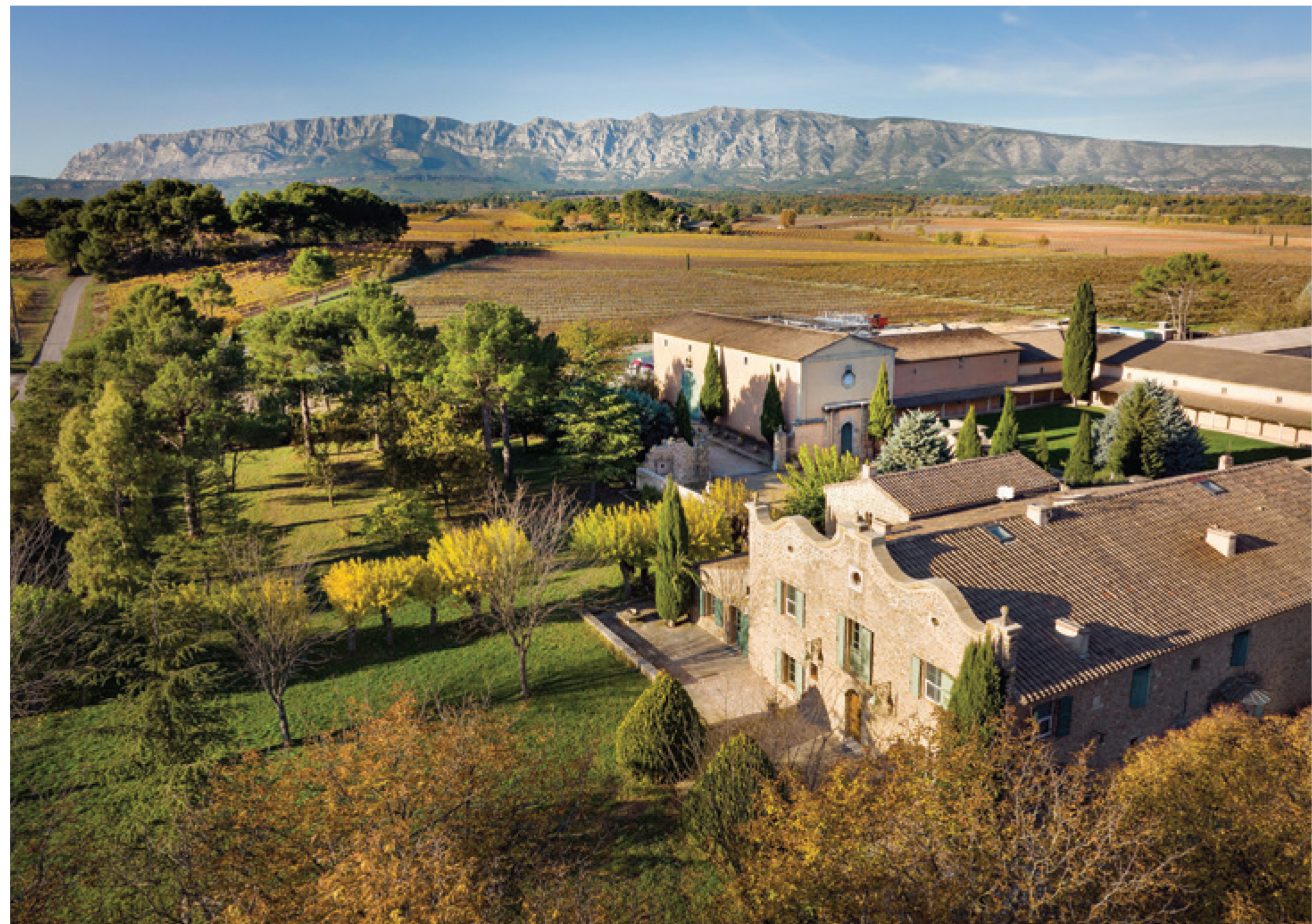
CHÂTEAU COUSSIN IN TRET

Provence rosés are the stars of summer but they also bring joy all year round. Grown in a magnificent region in the South of France, they offer outstanding variety and are worth rediscovering for their joyful character and their wellness-inducing aromatic spectrum.